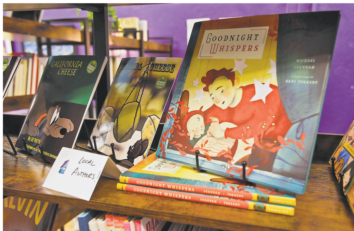
A selection of local authors are featured at WordHaven BookHouse in Sheboygan.